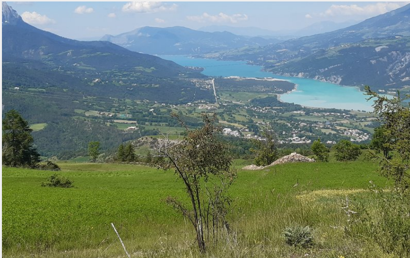
Le lac de Serre-Ponçon (florimont.tilliere)