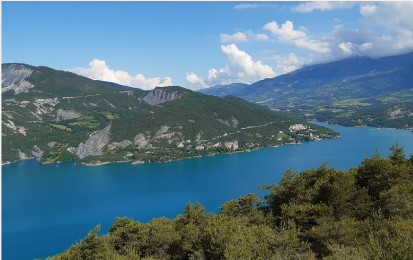
Le lac de Serre-Ponçon (florimont.tilliere)