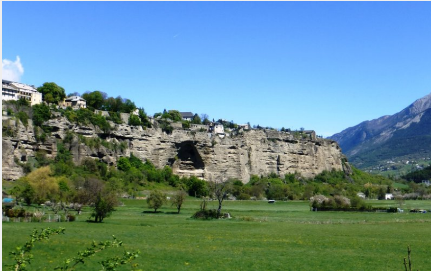
Le roc d'Embrun (florimont.tilliere)