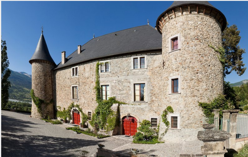
Château de Picomtal (florimont.tilliere)