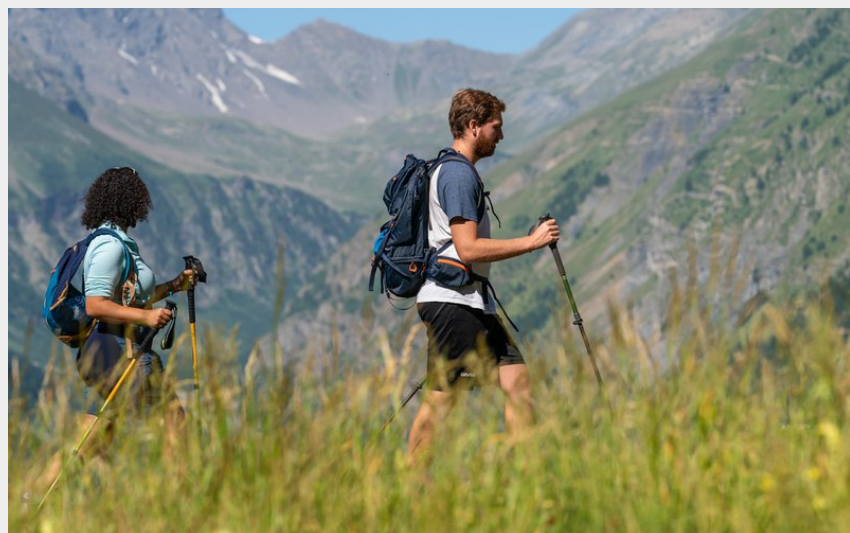
Au col de la Pusterle