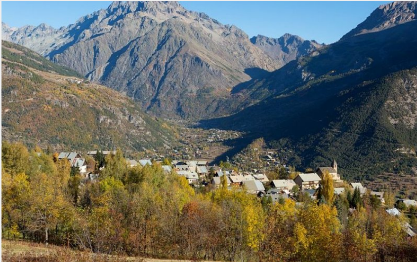
Village de Puy-Saint-Vincent