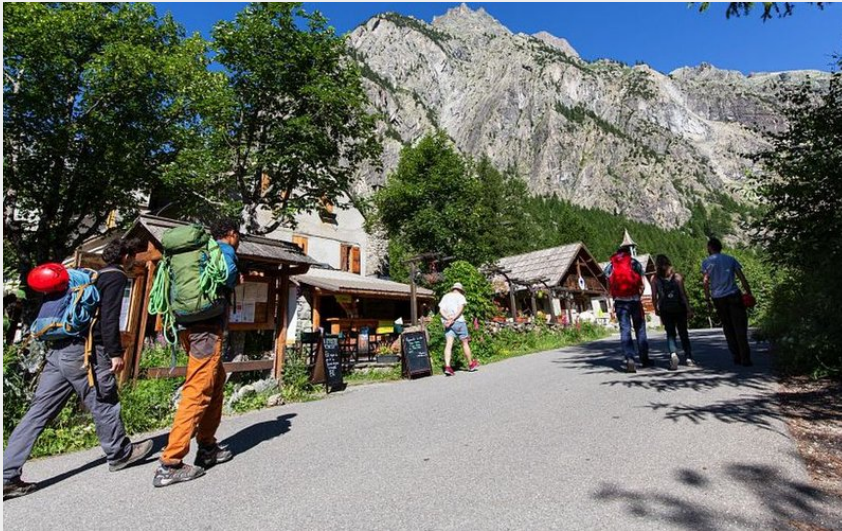
Hameau d'Ailefroide - Chapelle de Bon Secours