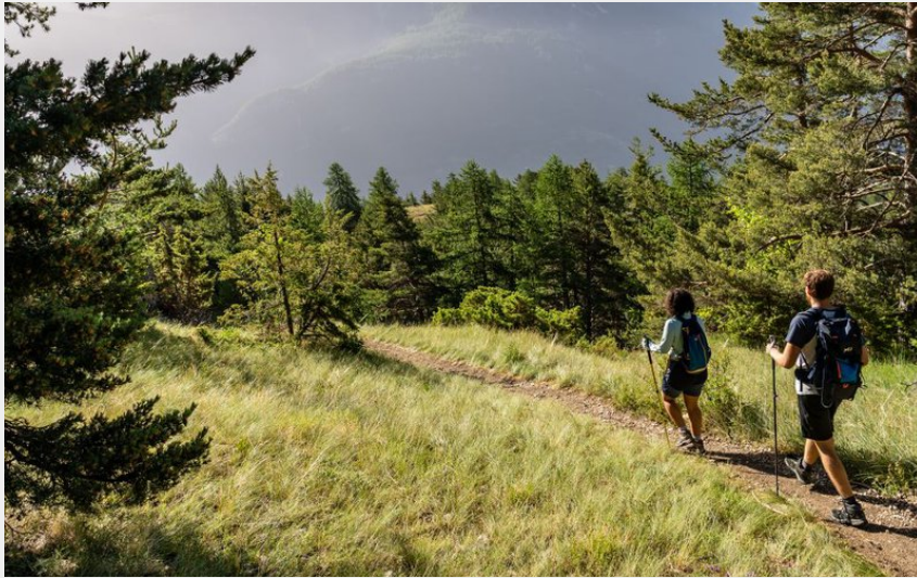
alentours de Bouchier