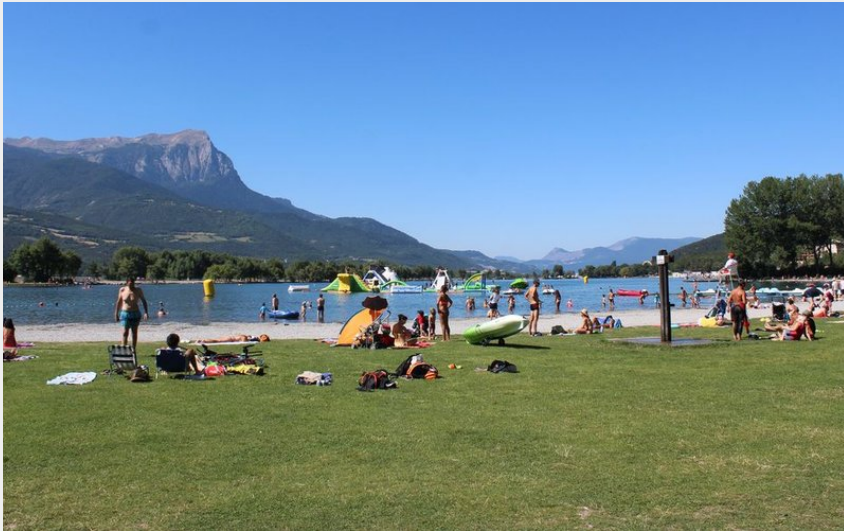
Plage du Plan d'eau (OTSP Serre-Ponçon)