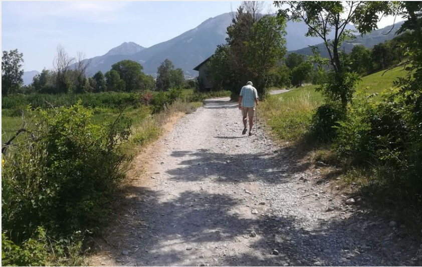
Promeneur sur le sentier de la Boucle de La Mûre