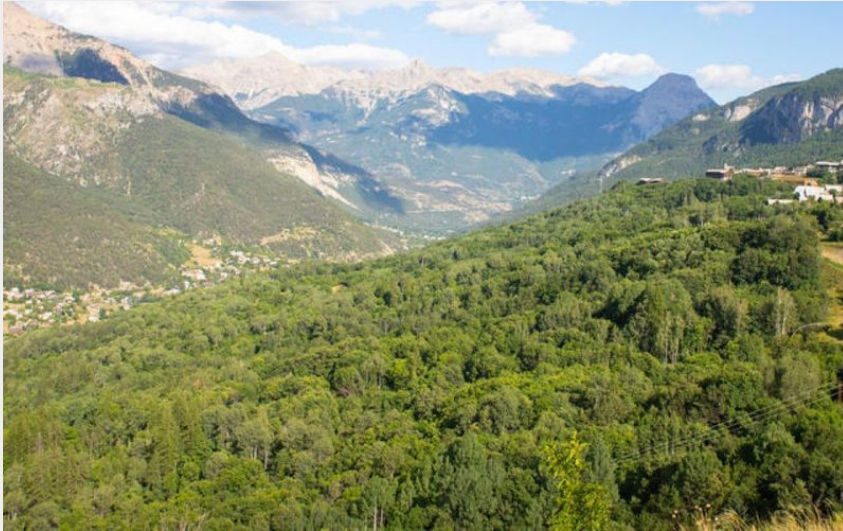
Les eyssarts (Thibaut Blais)