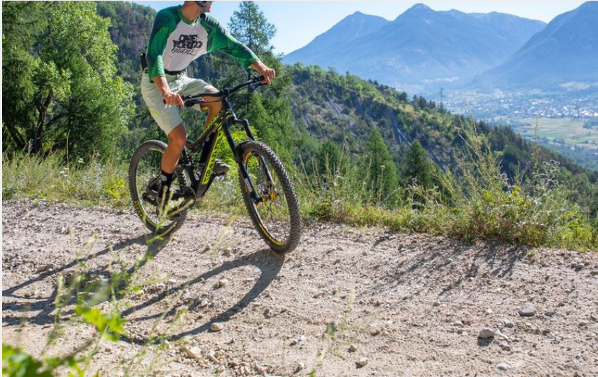
Chapelle Saint Ours (Thibaut Blais)