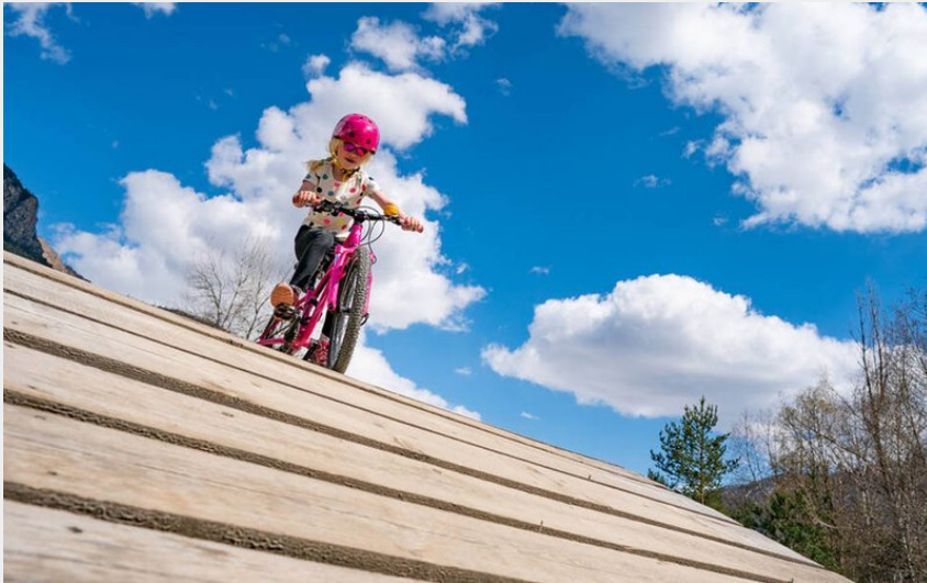
(Rogier Van Rijn)