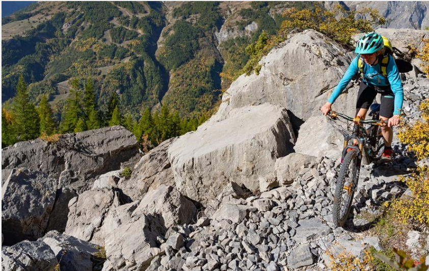
vue sur le Pelvoux (rogiervanrijn)