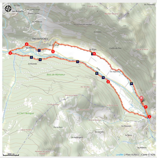
Plaine 2 (victor.andrade)

Easy circuit along the Biaysse which takes you into a pleasant and peaceful environment surrounded by nature.