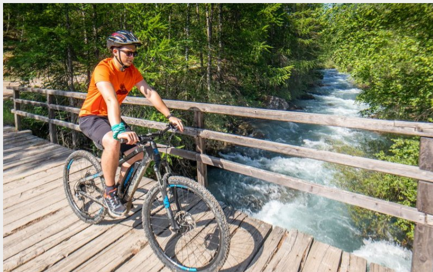
Plaine 2 (victor.andrade)