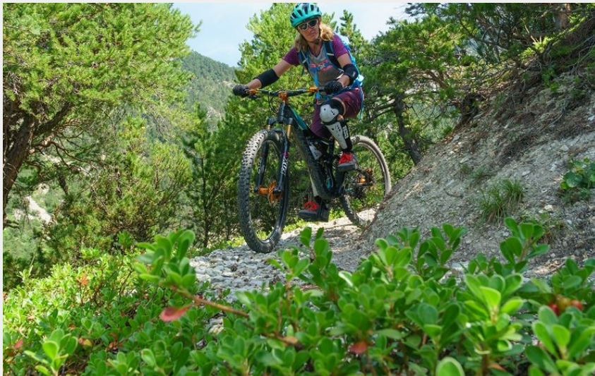
sentier en forêt d'adret (rogiervanrijn)