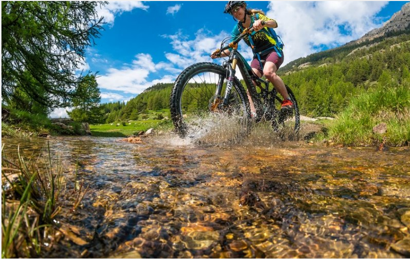
traversée torrent (rogiervanrijn)