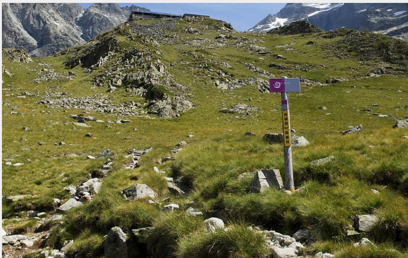
limite du parc sous le refuge de l'Olan (Olivier Warluzelle)