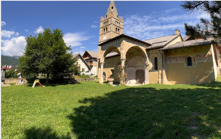
Église Saint Laurent des Vigneaux (Pays des Écrins - Pierre Nossereau)