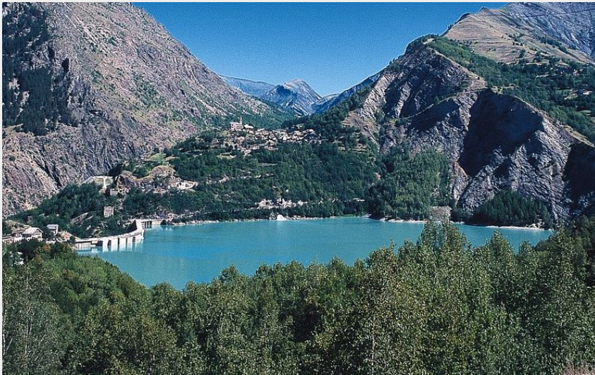
Lac Chambon (Pascal Saulay)