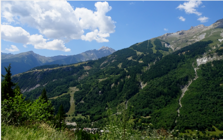
Vue sur la station de Pelvoux