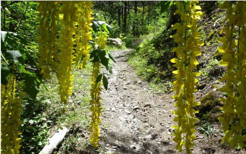
Le sentier du Cloutas