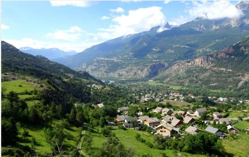
Vue sur la vallée de la Durance