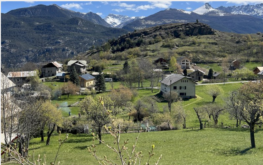
Champcella (Pays des Écrins - Pierre Nossereau)