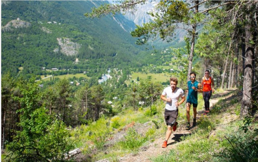
Traileurs - Parcours Trailounet (Thibaut Blais)