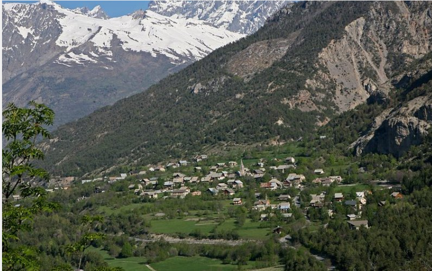
Village des Vigneaux et plaine de la Vallouise (Parc national des Écrins - Bernard Nicollet)