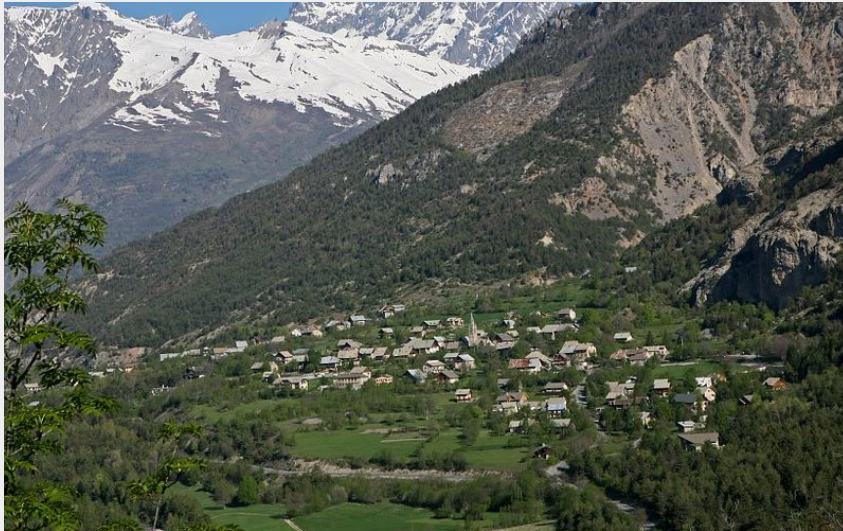
Village des Vigneaux et plaine de la Vallouise