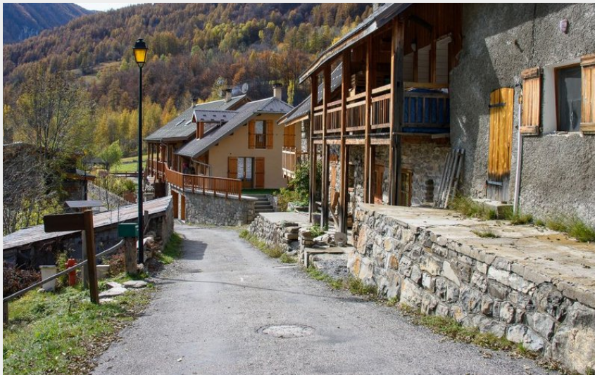
Le hameau des Gourniers à l'automne (Mireille Coulon - Parc national des Ecrins)