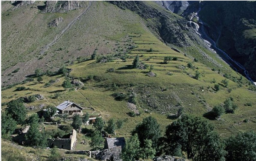
Refuge des Clots et l'ancien hameau (Cyril Coursier)