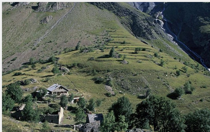
Refuge des Clots et l'ancien hameau (Cyril Coursier)