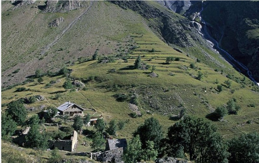
Refuge des Clots et l'ancien hameau (Cyril Coursier)