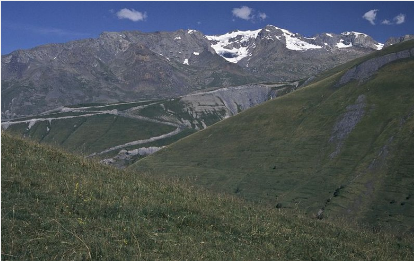
Les Grands Rousses