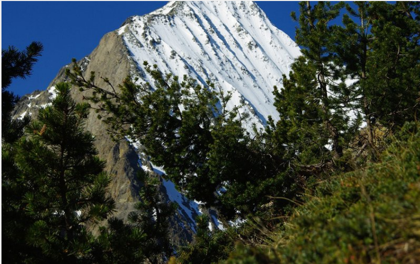
Face nord du Grand Armet vue sous Plancol