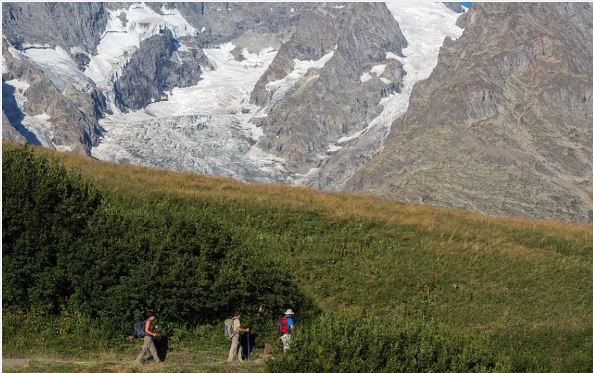
Le sentier des Crevasses