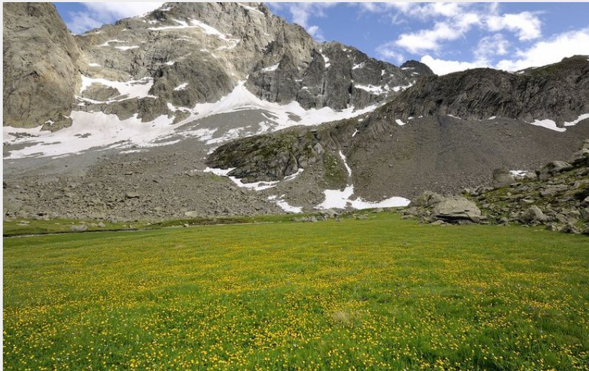
Tapie fleuri au pieds du Sirac, depuis Vallonpierrre