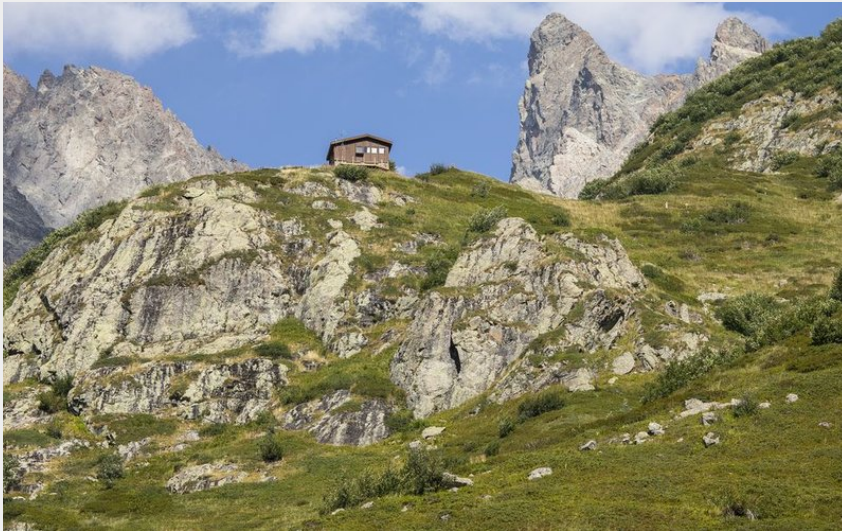
Refuge de Chabournéou