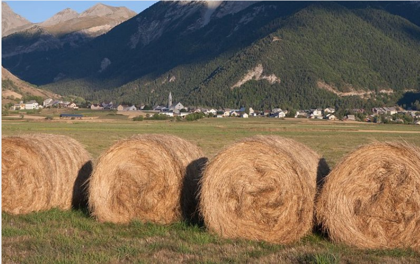
La plaine d'Ancelle - foin (Pascal Saulay - PNE)