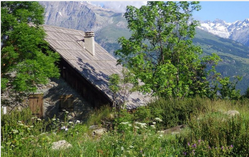
Vue sur le Glacier blanc depuis Prés d'Aval