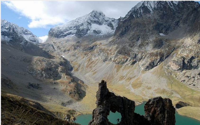
Roche percée de la Muzelle