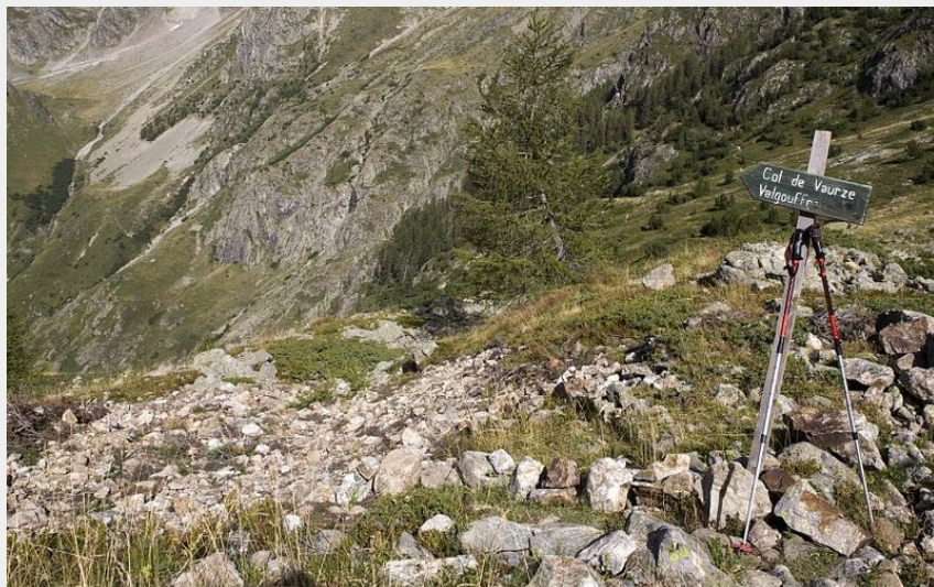
Du refuge des Souffles au col de la Vaurze (Pascal Saulay - PNE)