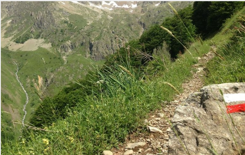
Sentier en direction du refuge des Souffles

Valgaudemar - La Chapelle-en-Valgaudemar