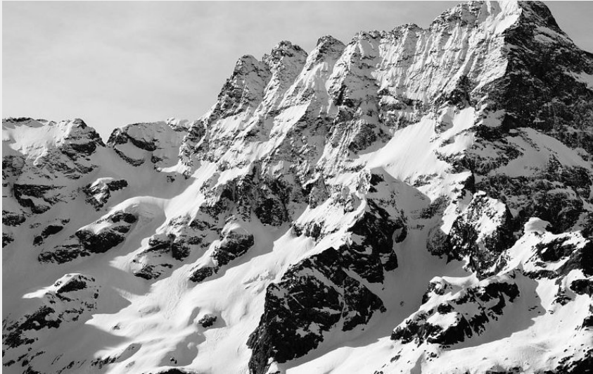
Le Sirac et la brèche en V