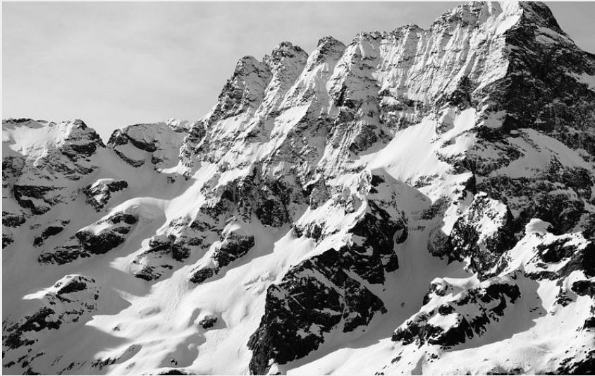
Le Sirac et la brèche en V