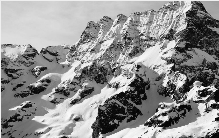
Le Sirac et la brèche en V