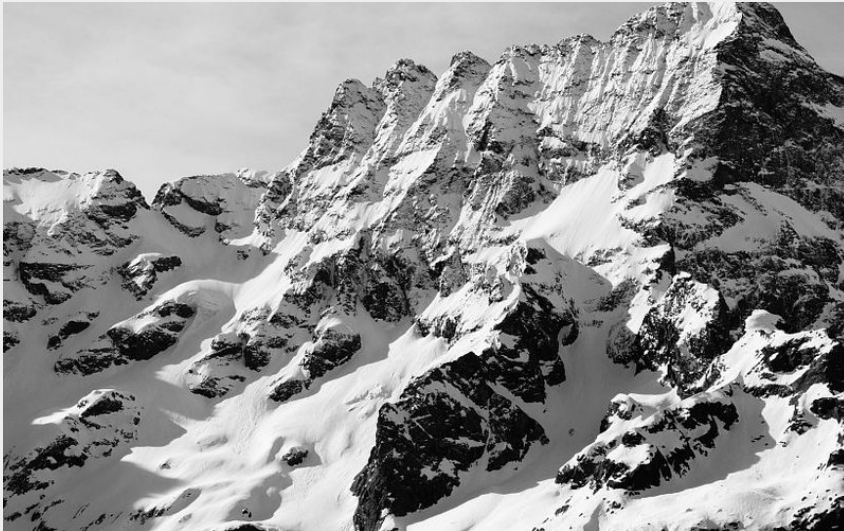
Le Sirac et la brèche en V