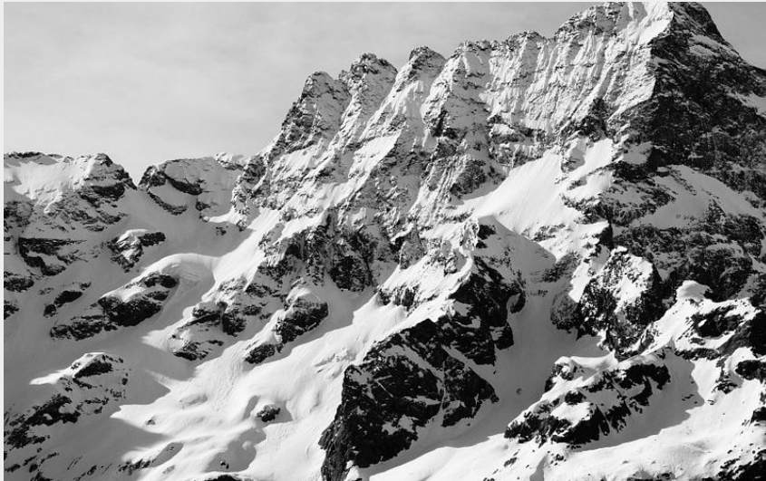
Le Sirac et la brèche en V