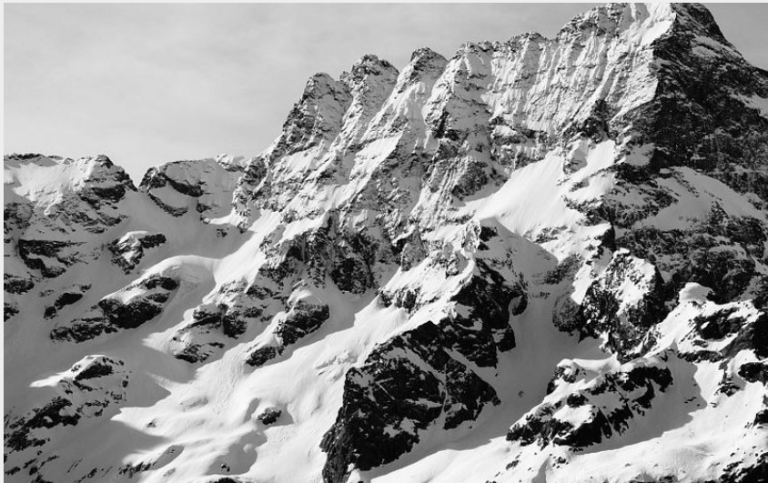
Le Sirac et la brèche en V