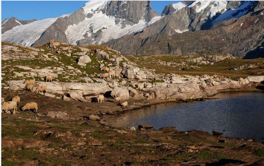
Troupeau d'ovins au plateau d'Emparis (Denis Fiat - PNE)