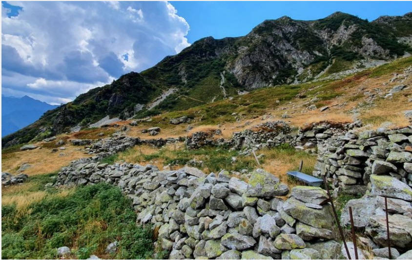
Site des 6 cabanes (Frédéric Sabatier - Parc national des Ecrins)